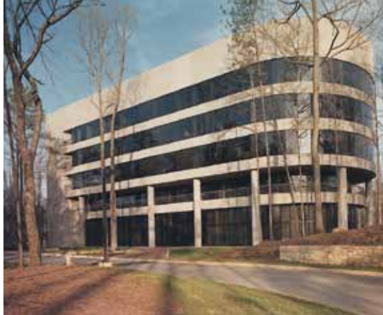
Figure 5 The Chick-fil-A corporate headquarters in Atlanta has added an annex, constructed 15 years after the original, that is clad with the same precast mix design and panel detailing, seamlessly blending the two structures into a corporate campus.

In some cases, durability and strength are significant factors in a client's program. In designing a data-processing center for a major financial institution in North Carolina, we decided on an all-precast concrete structure, using 14-inch-thick, load-bearing precast concrete wall panels to meet the owner's aggressive construction schedule and stringent performance criteria (see Fig. 7 ). Due to the sensitive nature of the building's operations, the owner's criteria required the building to withstand high wind loads as well as enhanced seismic loads.