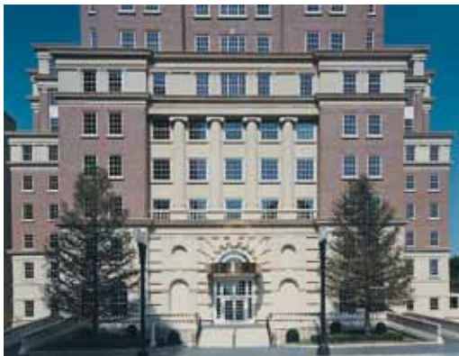
Figure 4 Color and detailing of the precast members at the Peachtree Office Condominium were developed to complement adjacent historical structures constructed of brick and limestone.

ents. In addition, highly developed engineering, management and factory production techniques within the precast industry help to ensure a high-quality finished product, which meets the project's requirements for cost and schedule.