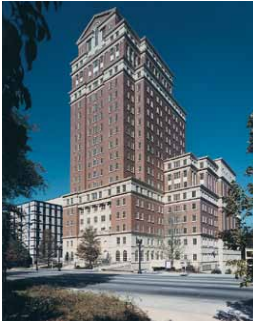
Figure 3 Buff-colored precast was used for cornices, trim members, sills and belt courses in conjunction with hand set brick to compose the classically proportioned façade of the Peachtree Office Condominium in Atlanta.