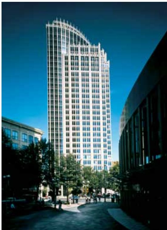
Figure 6 The IJL Corporate Headquarters in downtown Charlotte, N.C., features two colors of sandblasted precast concrete along with granite clad precast panels.