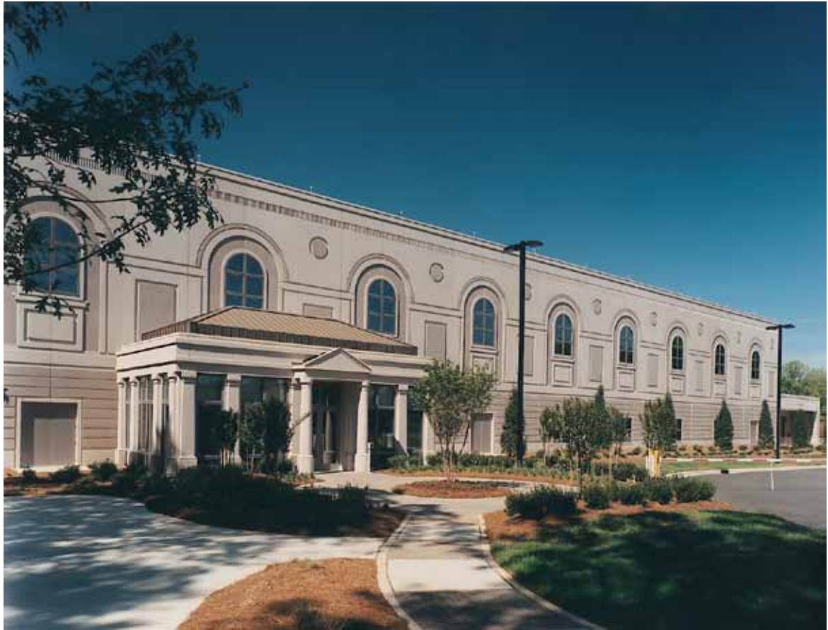
Figure 7 Designed to withstand extreme wind and seismic loads without resembling a bunker, this data-processing center uses load-bearing precast concrete wall panels and structural precast floor and roof slabs.