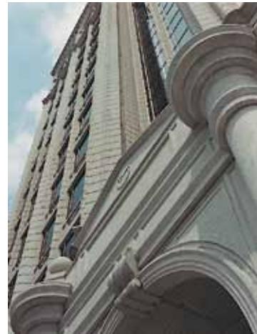
Figure 1 At the Jefferson Pilot Corporate Headquarters addition in Greensboro, N.C., sandblasted precast panels were used in the design of the new structure to reflect the scale and character of the terra cotta cladding of the original building.

Figure 2 Molding profiles for the Jefferson Pilot Corporate Headquarters were developed from field measurements and original drawings of the existing building. Deep reveals in the precast panels reflect the scale and detailing of the original structure. Careful layout of panels and reuse of formwork profiles allowed the design of the new building to match the level of detailing of the existing structure while meeting the owner's budget requirements.